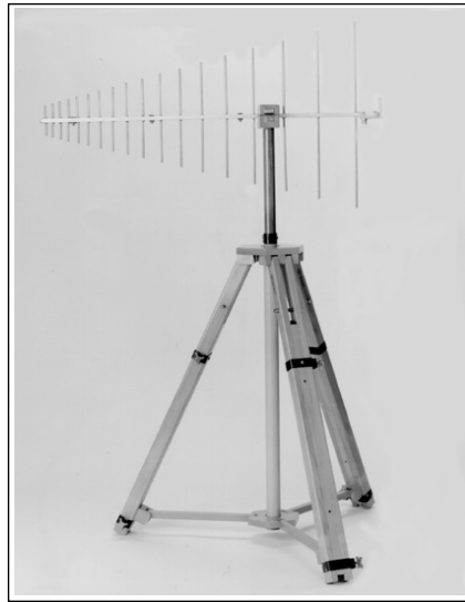
Figure 1.1 Log Periodic Antenna (w/ tripod AT-100)