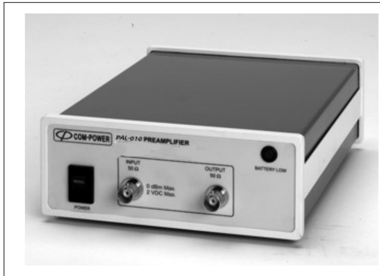
Figure 1.1 Model PAL-010 Preamplifier